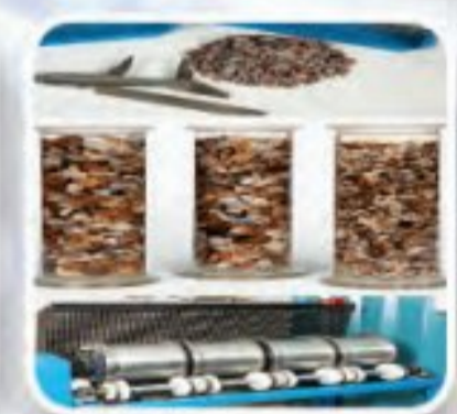
Rock & Aggregates Testing