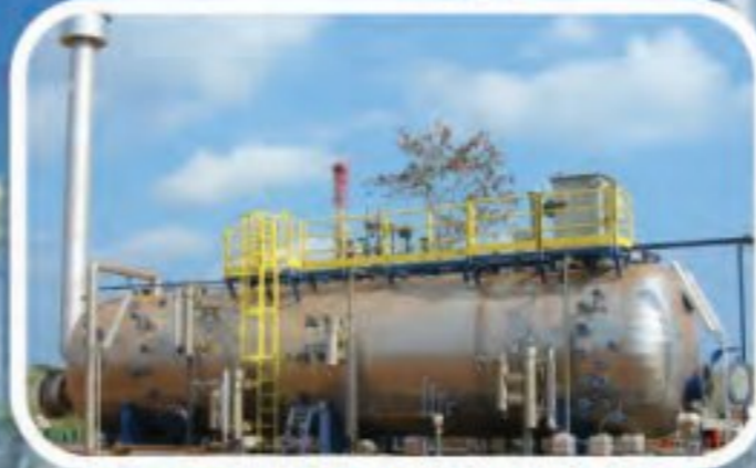
THIRD PARTY & VENDOR INSPECTION