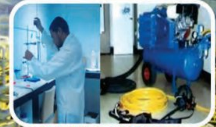
CHEMICAL ANALYSIS OF WATER & AIR QUALITY TESTING SERVICES