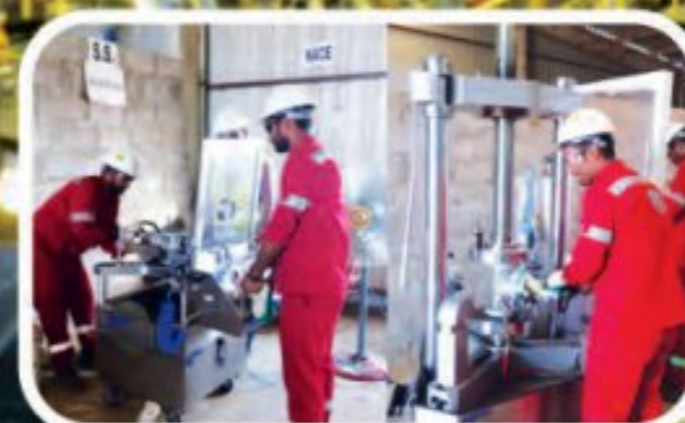
VALVE TESTING, REPAIRING & OVERHAULING SERVICES

"YOUR SUCCESS IS OUR GOAL & QUALITY IS OUR MOTTO"