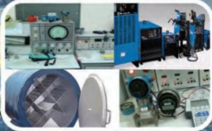
ALL TYPE OF INSTRUMENT & EQUIPMENT CALIBRATION