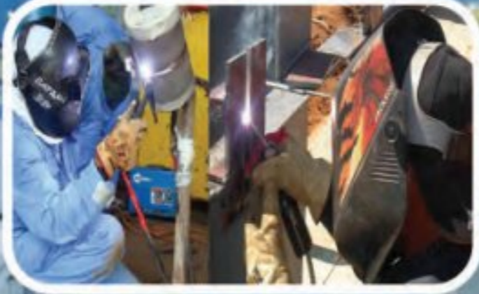
QUALIFICATION OF WELDING PROCEDURE & WELDER QUALIFICATION

An ISO 9001:2008, OHSAS 18001:2007 & LEAA Certified Company and ISO 17025:2005 Accredited Laboratory for Calibration & Testing Services