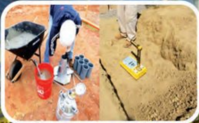
SOIL, CONCRETE, ASPHALT, COMPACTION, AGGREGATE & CEMENT TESTING GEO TECHNICAL SERVICES