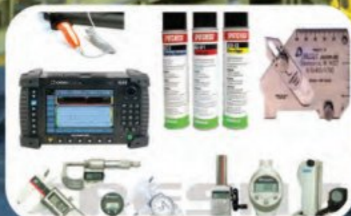
INSPECTION TOOLS & TRADING