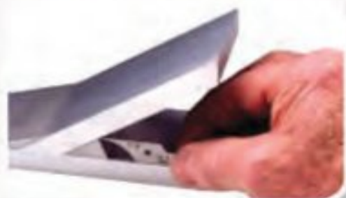
Mini Fillet Gauge