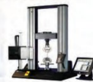
Tensile & Compression