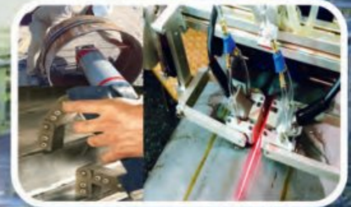
NDT & ADVANCED NDT SERVICES