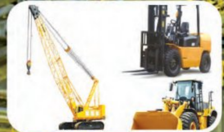
LIFTING TOOLS & HEAVY EQUIPMENT INSPECTION