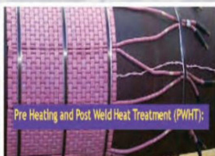
Pre Heating and Post Weld Heat Treatment (PWHT):