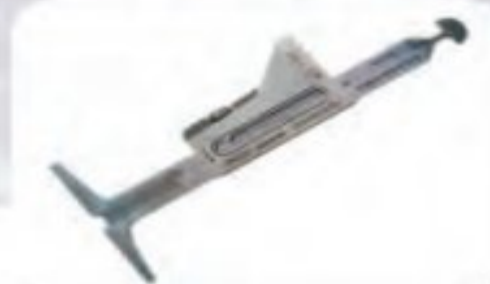
Hi Low Gauge