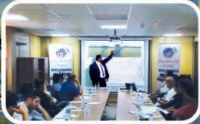
TRAINING-AWS, TWI, NDT, ISO, Etc...